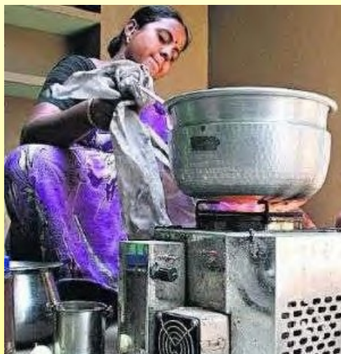
BP Oorja Stove: Smokeless Biomass Stove

Surya's study methodology is unique because it aims to collect high quality, reliable data at every level, from the individual household to the village, to the regional impacts of the project intervention. Household data will be collected via cutting-edge sensor technologies and analytics installed in mobile phones distributed to participating households. These mobile phones will measure individual reductions in exposure to pollutants as well as adherence to the intervention in a distributed and scalable fashion that improves on traditional data collection technologies. Instrumented towers installed in each region will collect climate-related metrics at the village level, including concentrations of BC, carbon monoxide, and ozone, and will measure the resulting change in the solar heating of the air and the ground. Finally, these data will be combined with the most advanced data from A-Train NASA satellite ( http://aura.gsfc.nasa.gov/instruments/omi.html ) to measure the regional heating effects and probable cooling effect of other particles emitted when solid biofuels are burned.